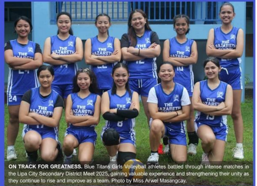
ON TRACK FOR GREATNESS. Blue Titans Girls Volleyball athletes battled through intense matches in the Lipa City Secondary District Meet 2025, gaining valuable experience and strengthening their unity as they continue to rise and improve as a team.

Meanwhile, the Girls Volleyball Team faced a tough series of matches, falling short against Lodalod (23–25), Lipa Integrated High School (22–25), Lumbang (20–25), and BCAS (21–25). Though victories were not secured, these games served as valuable learning experiences, motivating the team to further improve their skills, teamwork, and confidence for future competitions.