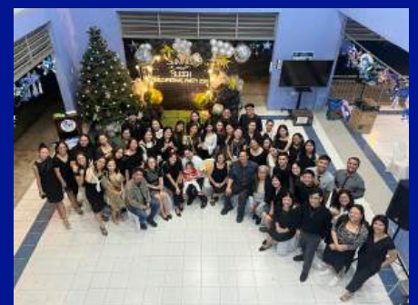
SHIMMER AND SLEIGH. The Nazareth School family poses with glee during the faculty and staff Christmas Party at the school lobby, December 17.

Overall, the school-based Christmas parties enjoined everyone to relax and savor the start of the holiday break.