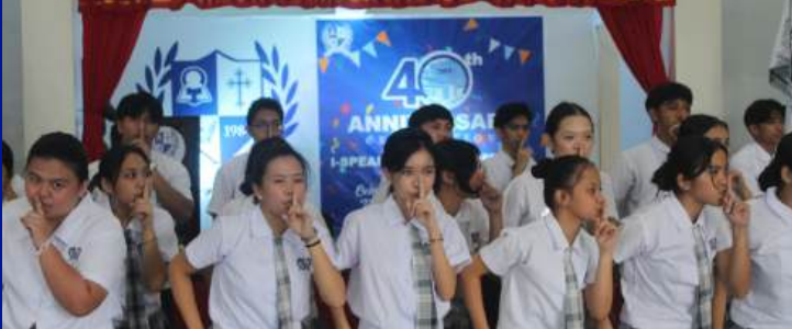
STUDENTS IN ACTION. Grade 9 students (upper) dance for an English play. Grade 12 students (lower) deliver a speech choir.