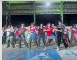
2000'S GROOVE. Grade 10 students showcase an energy-packed dance, December 17.

ONE TNS FAMILY. The Nazareth School administrators, faculty, and staff join for an anniversary shoot igniting oneness and teamwork.