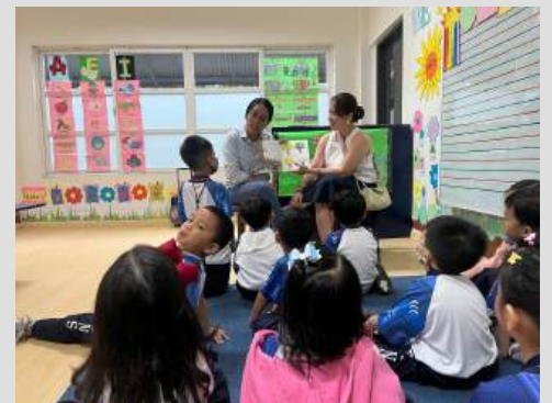
IT'S STORY TIME. Parents read story books for little kids, December 6.

All in all, PLC's MI Day was a successful event highlighting the integration of students' varied skills, talents, and interests for them to prosper into lifelong and progressive learners.