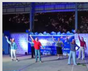
GEN Z VIBE. Parent Association officers render a lively dance showcase.

Classes were respectively grouped into four different decades for a revolutionary dance showcase and field demonstration stints. Grades 4 to 6 rocked the 1980s, Nursery to Grade 3 swayed the 1970's way, Grades 7 to 10 represented the 2000's era while Grades 11 to 12 vibed with the contemporary 2020's musical regime.