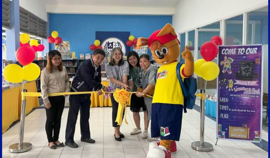
FOR THE LOVE OF READING. TNS Academic Council cuts the ribbon to kick-off the book fair together with WS Publications staff and mascot, December 9.

In line with its 40th founding anniversary celebration, The Nazareth School of Lipa City organized a three-day book fair by WS Pacific Publications, Inc. to motivate students to dive into the world of reading and to cherish the knowledge one gets from books, December 9-11.