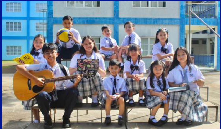
MI Models. TNS students represent various Multiple Intelligences which is the core of the school's Vision, Mission, and Core Values.

The Nazareth School's 40th founding anniversary was a joyful and memorable celebration that left a lasting impression on everyone who participated. The event honored the school's rich legacy and its significant impact on the community. Alumni, parents, teachers, and students gathered to share heartfelt messages, reflecting on their experiences and the values instilled by the school over the years.