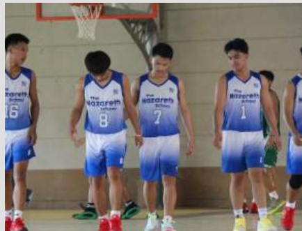
ONE GOAL, ONE TEAM. TNS Basketball varsity players during a match in line with LIPRISAA Meet 2024.

Before the games started, they did some stretching, warm-ups, and ball drills. Although UB won, the girls played well, having won the game with STI. Afterward, they were given an evaluation of their games and returned safely to school.