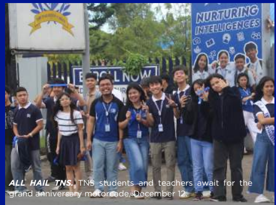
ALL HAIL TNS. TNS students and teachers await for the grand anniversary motorcade, December 12.

The convoy of vehicles traveled through various areas, including schools, malls, tight-knit neighborhoods, and more. The striking blue accents on